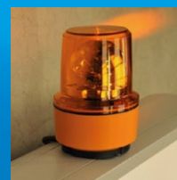
Rotating warning light