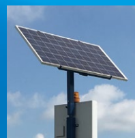
Solar panel for power supply